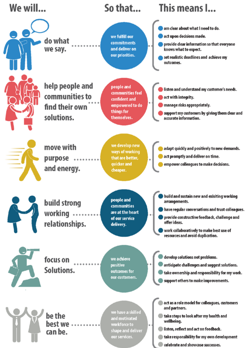
Figure 2 Warwickshire's Six Key Behaviours